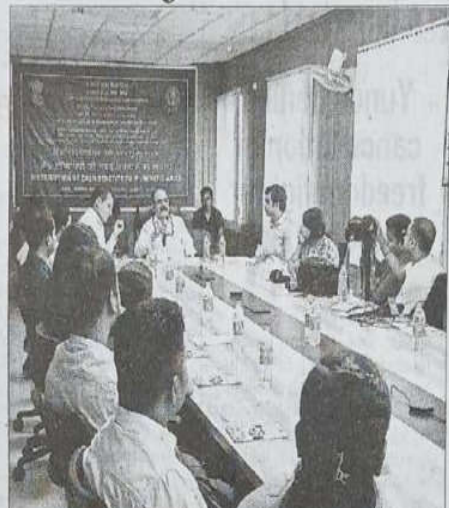
The special event on Wednesday

He also outlined ESIC's roadmap for further strengthening its coverage and service delivery in the Northeast, with a focus on ensuring timely, accessible